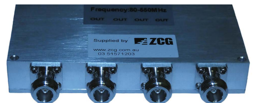
4 x N-type female outputs